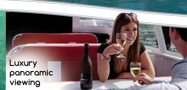
Luxury panoramic viewing