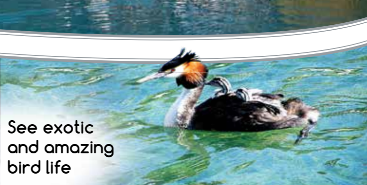
See exotic and amazing bird life